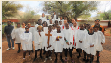
Yirara College: many languages, many histories