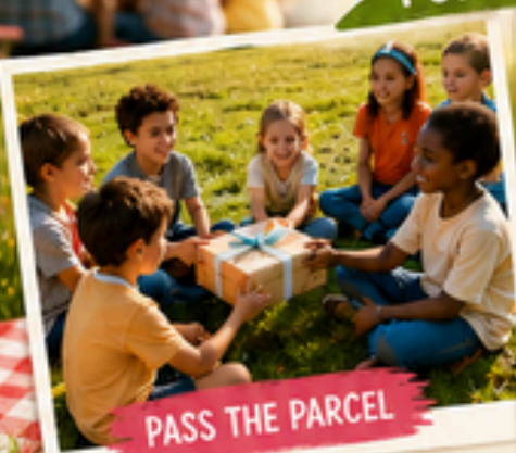
PASS THE PARCEL