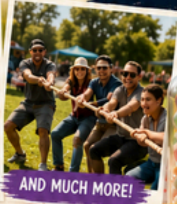
AND MUCH MORE!