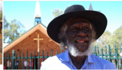
'God has always looked after us'